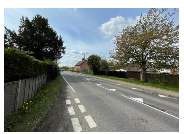
Turn left on to the A229, briefly

You immediately pass a garage on the left. Take the right turn after the garage, which is signposted to Balfour Winery. This is Pinnock Lane.