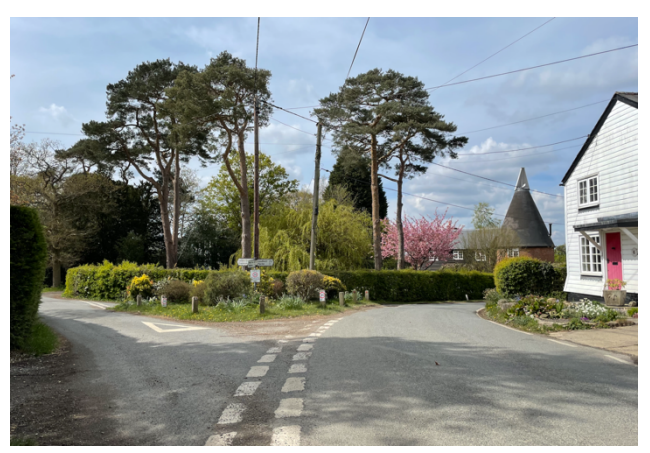
Don't turn left, stay on Curtisden Green Lane

Once you've reached the top there is a left turn, but follow the road round to the right. You are now at Curtisden Green.