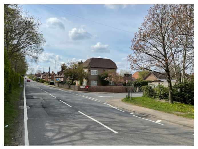
Take this right turn off the A229, signposted to Balfour

You immediately pass a garage on the left. Take the right turn after the garage, which is signposted to Balfour Winery. This is Pinnock Lane.