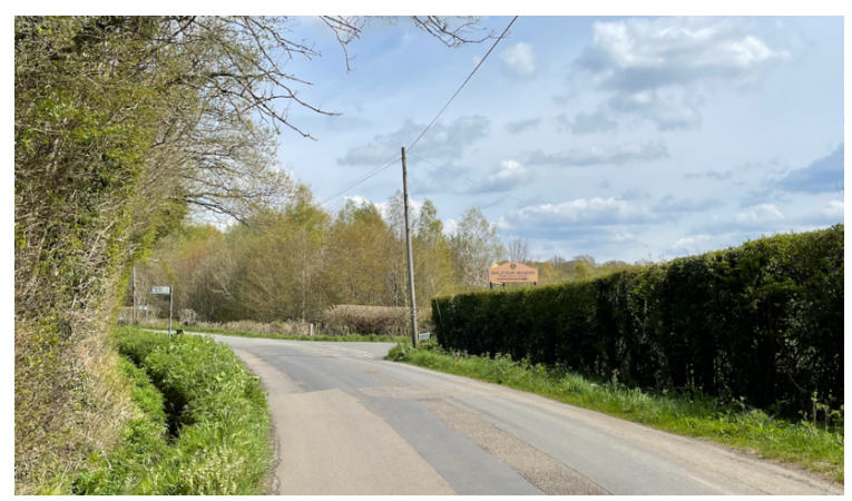
The right turn back to Balfour/Hush Heath

Make sure you turn at the right place for Balfour Winery after coming down the hill – you'll see their sign.