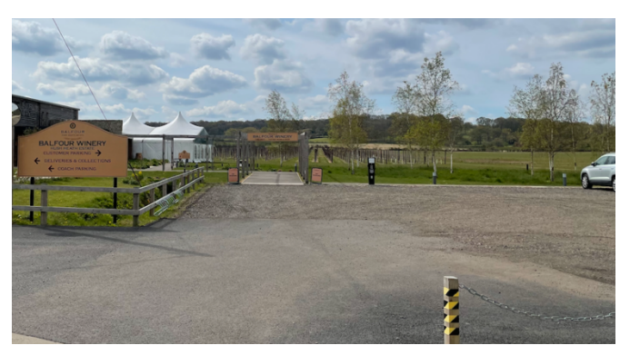
There are racks for bikes in the car park