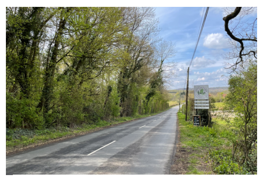
You'll see a sign saying Lower Ladysden is coming up on the right

Turn left onto Winchet Hill (B2079). After just less than half a mile you will see the entrance to Lower Ladysden Farm on your right.